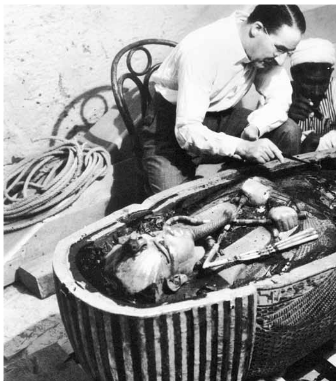
TOP: THE NEW YORK TIMES; BOTTOM: THE GRANGER COLLECTION