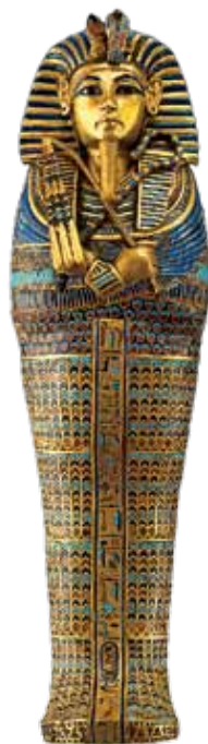
This coffin found inside King Tut's tomb held his mummified liver!

that. When I took this job, they told me that a bunch of other drivers had already turned it down.