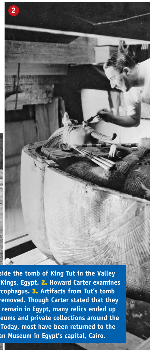
1. Outside the tomb of King Tut in the Valley of the Kings, Egypt. 2. Howard Carter examines the sarcophagus. 3. Artifacts from Tut's tomb being removed. Though Carter stated that they should remain in Egypt, many relics ended up in museums and private collections around the world. Today, most have been returned to the Egyptian Museum in Egypt's capital, Cairo.

N3: Just then, the lights flicker and go out. The room is completely dark.